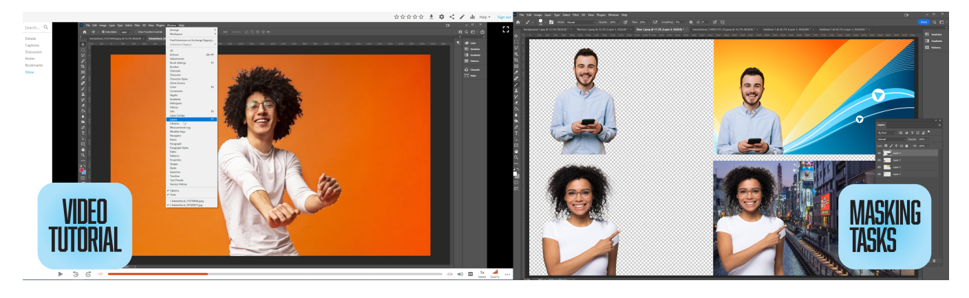
Figure 2: The initial and final stages of a masking task performed by participants using Adobe Photoshop, with the video tutorial accessible by a key stroke at any point during the task (left panel). We also illustrate the starting point of Tasks 1 & 2 and the expected outcome of each task (right panel).

We used a supervised learning approach with evaluations provided by our education specialist as labels for our model. The educator individually assessed the quality of the final mask for each task, giving each mask a score between 1-5. The educator focused on factors such as the visibility of edges from the original image, the correction of hair in Task 2, and the presence of background elements in the mask. A score of 5 corresponds to a mask with clean edges, corrected hair, and fully masked subjects, while a score of 1 would be given to masks that ignored the video tutorial, had uneven mask lines, or inadvertently revealed the background rather than the masked individual. "In a real classroom, I use a 5 point or 10 point rubric, depending on the project. The key difference between how I scored this project from a course project is that, in the course, I'm typically looking at a variety of other skills as well. Each project will have 10 categories of 10 points or 10 categories of 5 points."