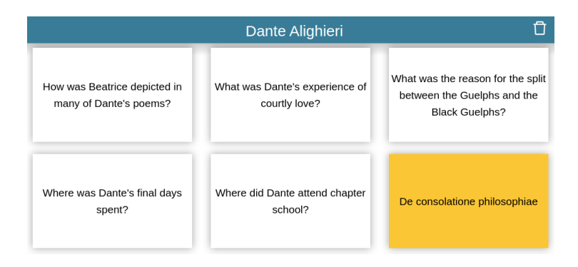
Fig. 2. Grid view for the topic Dante Alighieri . The white squares contain the questions and the yellow square is the answer to "What Boethius work did Dante read?" .

about it, choosing from four options: "The answer does not fit the question", "The answer is wrong", "The answer is trivial" and "Other" (where the user can input their own text). Finally, after the answer is shown, the user is asked to label the difficulty of the card choosing from five possibilities, from "Too easy" to "Too hard" or alternatively, as "Not interested". These feature may be used in future work for designing algorithms that decide the optimal card ordering for human learning. Figure 2 shows an example of generated cards displayed in grid view.