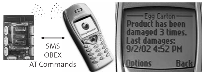
Figure 1: Product monitoring using BTnodes as smart tags and SMS via mobile phones.

Copyright is held by the author/owner. SenSys'03 , November 5–7, 2003, Los Angeles, California, USA. ACM 1-58113-707-9/03/0011.